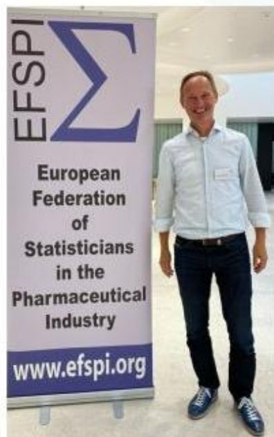
EFSPI President 2024–2025